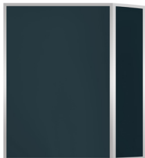
Metal frame / lacquered MDF